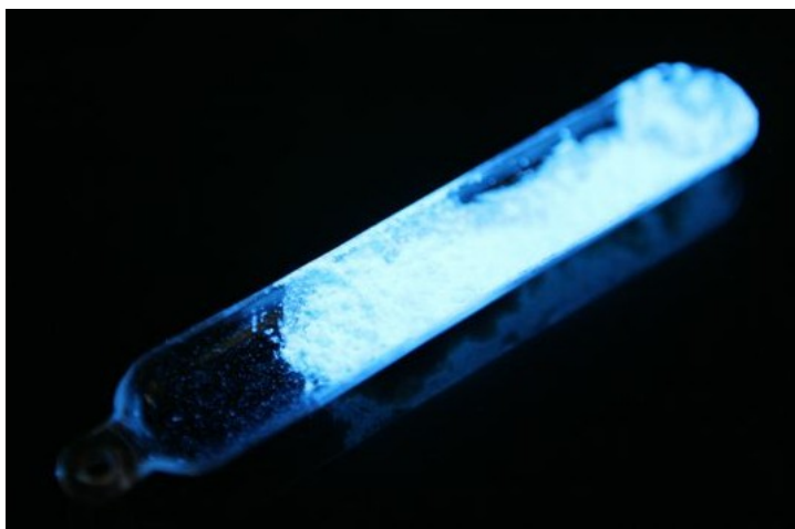
Excitation color at 366nm

All applications using this product should be thoroughly tested prior to approval for production.