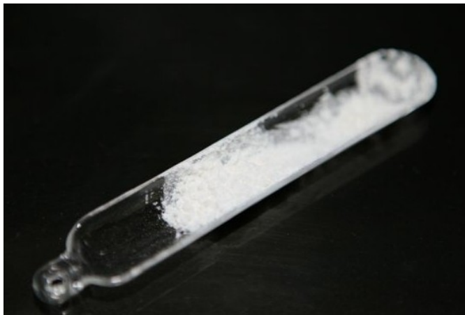
Appearance at visible light